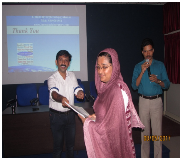
Distribution of Certificates (Vote of thanks)